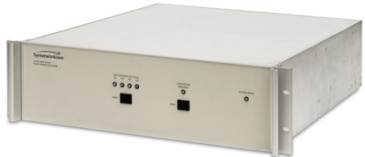
4145C Ultra-Clean Phase-Locked Oscillator